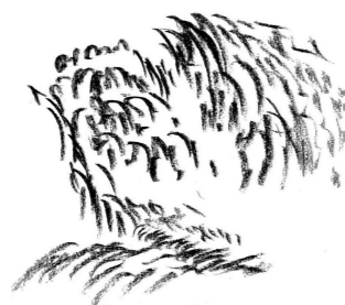
A splash of urgent black and white strokes form a waterfall. Drawing by Chaeyoung Kim.

Today is 12th of October. ¡Nada que celebrar! (nothing to celebrate) A special edition of the Trans*Feminist Counter Cloud Action FAQ with drawings and updates by Chaeyoung Kim and @grgr https://titipi.org/pub/FAQ.pdf #12o #CounterCloudAction