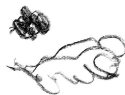
Two scribbles in black charcoal, one a tight knot or dark cloud, the other a running mouse or maybe also a cloud. Drawing by Chaeyoung Kim

#12o #CounterCloudAction @grgr #Chaeyoung_Kim